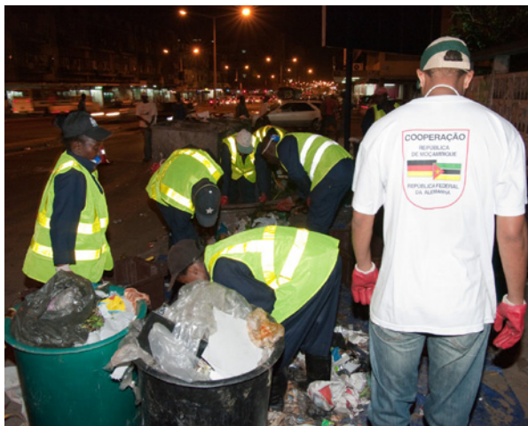
Figure 8: The analysis of waste composition and quantities form the first step in understanding the problem of SWM.

One of the primary findings of the Maputo case is that tools for strategic planning, specifically for the financial aspects of SWM are essential to establish a clear and common understanding of current challenges and the mechanisms of proposed solutions. Here it was specifically the cost calculations, which opened the eyes of the Municipal administration to the real dimension of the problem “solid waste”, even after first steps have been taken (such as the waste fee, which in its first instance was insufficient in terms of cost recovery).