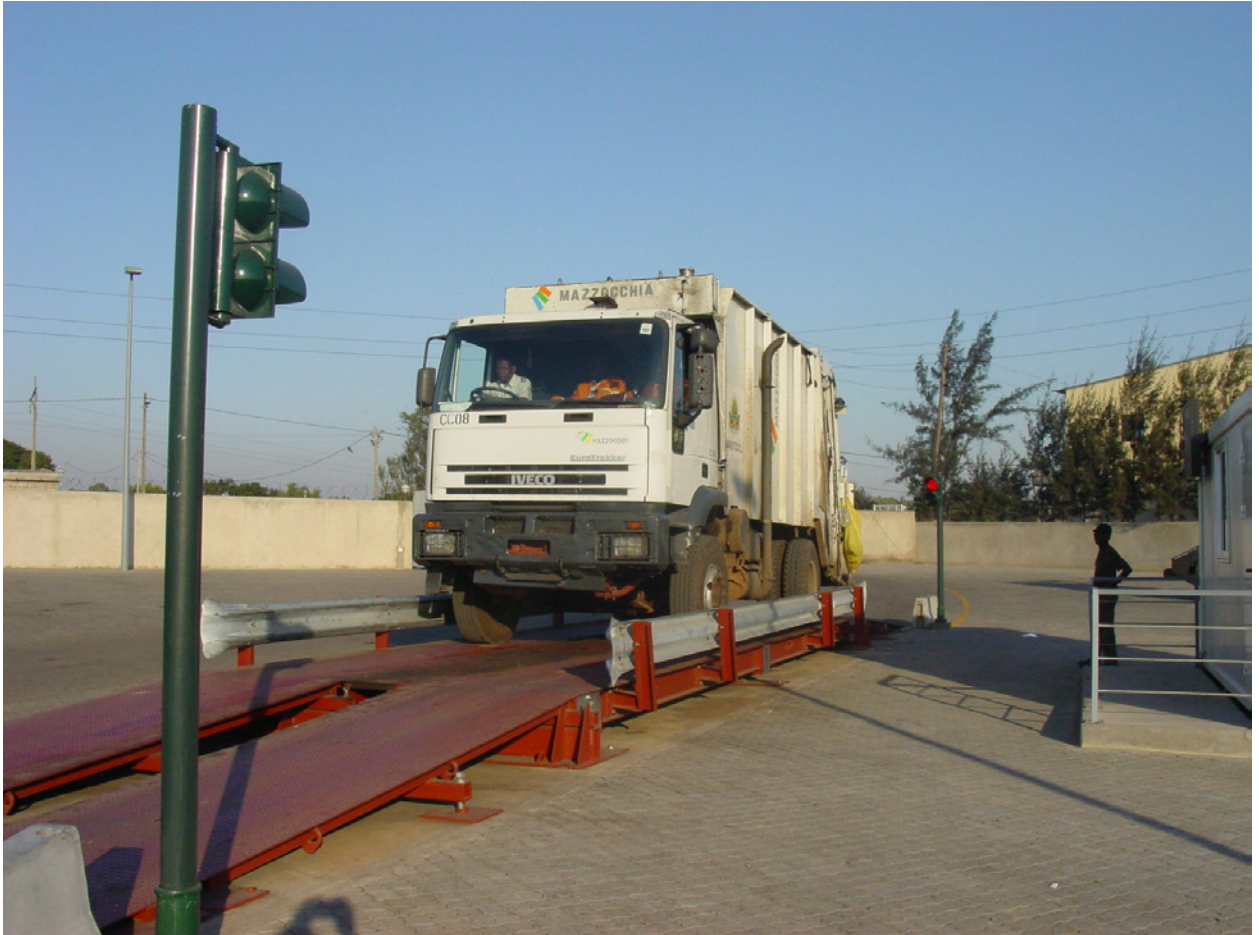
Figure 6: The weighbridge at the disposal site is a key requirement for contract management and disposal fees

Cases of uncontrolled disposal occur either in existing informal disposal sites or into the public containers of CMM. As a countermeasure the containers in the suburban areas are controlled by the neighborhood administration and the primary waste collection service. Additionally the urban districts as well as the Solid Waste Department have controllers in place to minimize these illegal activities. In several cases service providers had to pay significant fines or lost even their license due to such activities.