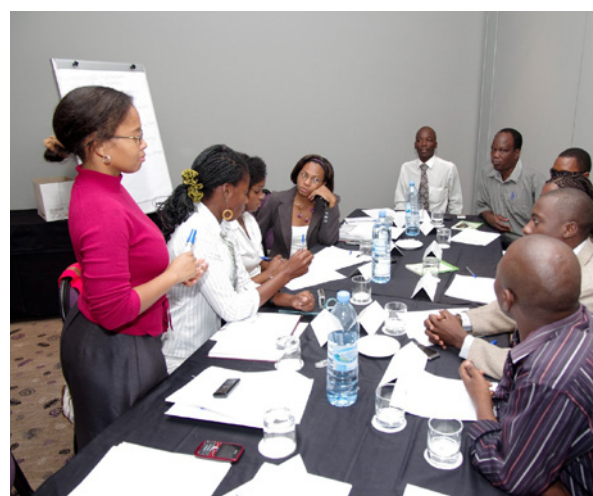
Figure 9: CMM internal workshop on the ProMaputo development programme

So, the key question for the future development of the sector is, whether CMM is able to maintain these factors active and to constantly improve their drive for change. The strategy allowed developing a collection system that is actually servicing all citizens. But further challenges lie ahead. Strategic decisions need to be prepared for final disposal, recycling and the perspective of an integrated waste management that explores waste as a resource. The institutional capacity needs improvement and a metropolitan approach to SWM management could yield logistic and economic benefits.