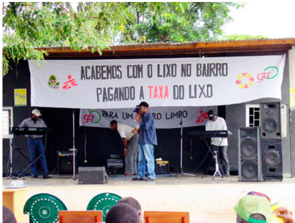
Figure 3: Neighborhood campaign for the waste fee (road show) in 2003

In order to restart the waste fee collection, an information and awareness campaign was thoroughly prepared. Television and Radio spots aimed on the contribution and responsibility of every citizen for the cleanliness of the city (“treat your city like your home, contribute by paying the waste fee”). Articles and advertisements in the newspapers tried to explain the necessity of the municipality to raise a fee for the services provided.