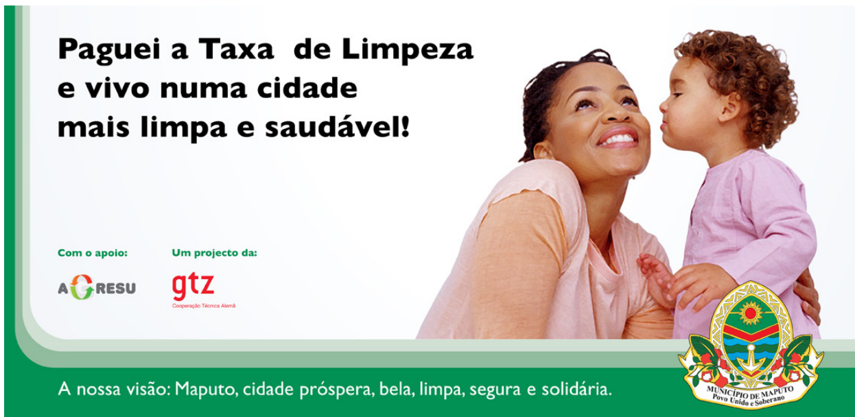
Figure 4: Example outdoor from the campaign for the 2007 revision of the waste fee (Text: I paid my waste fee and I live in a cleaner and healthier city!)