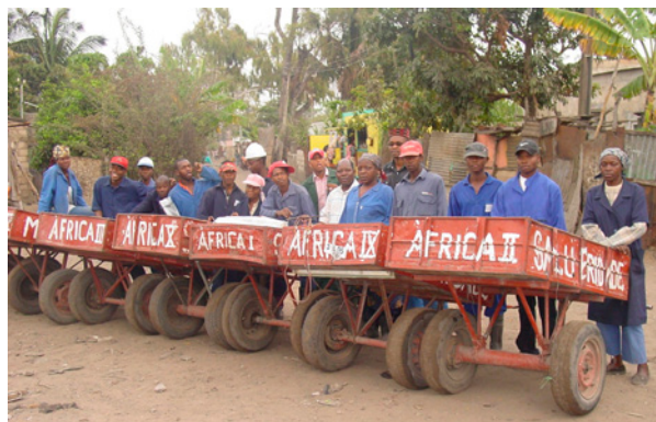
Figure 7: In 2011 primary waste collection finally covered all suburban neighborhoods

The model processes the expected revenues in a similar fashion. The main revenue streams are the waste fees, proof of service, disposal fees and specific service related fees. Fines are not relevant, because they are partly channeled to the general budget, partly to the benefit of the controlling unit. The model does not specify the amounts that have to be charged in different service areas. The process of tariff setting uses the expected revenues of the model as a reference for the total amount. Then the individual tariffs are established according to the existing client base of EDM.