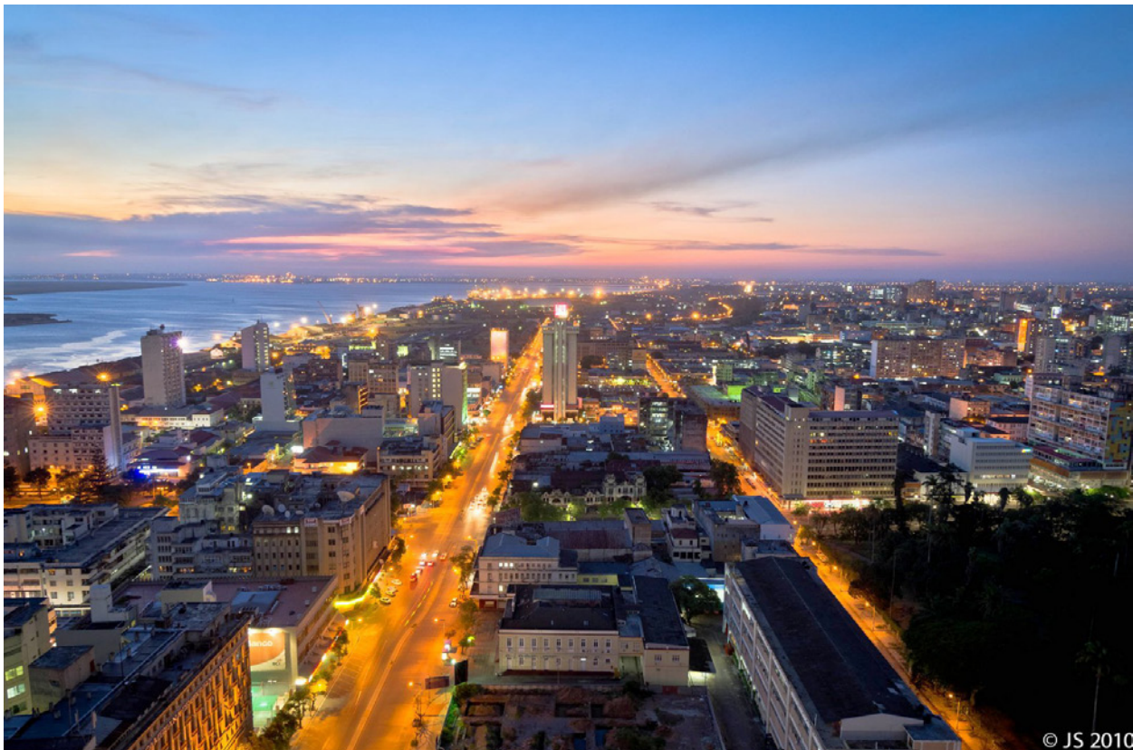
Figure 1: Evening view over the commercial district of Maputo

We will have a closer look at the Municipality of Maputo and on its way to achieve the objective of financially sustaining waste collection services and waste management in general. We start from the beginnings, where the overall budget of CMM did not exceed 2 Million USD per year, then go to the introduction and evolution of the waste fee and finally to the current situation of financial sustainability (Chapter 1). The instruments that have been designed and put in place will be described in detail in Chapter 2.