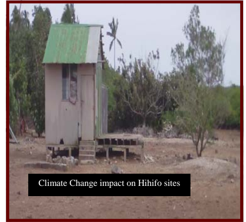
Climate Change impact on Hihifo sites

The meeting ended with a high note as the community water committee was made aware that the Technical Team