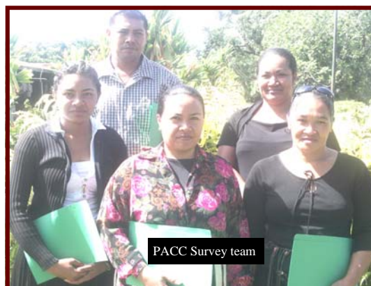
PACC Survey team