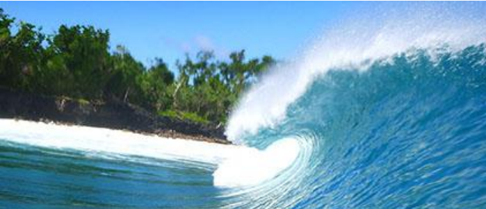
Forecasting damaging swells is a focus of Pacific Met Services