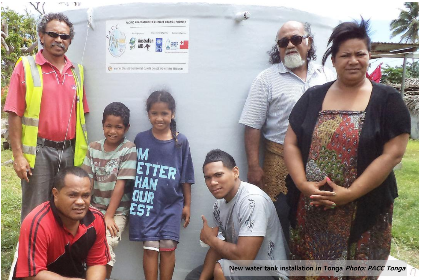
New water tank installation in Tonga