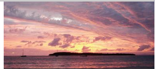
Mangaia, Cook Islands