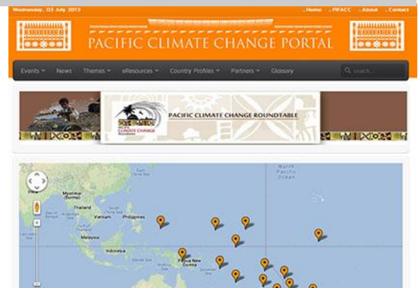
Pacific Climate Change Portal homepage

Welcome to the Pacific Adventures of the Climate Crab!