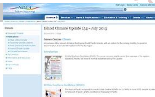
NIWA Island Climate Update