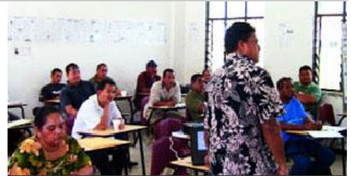
Presentation to Kosraean teachers