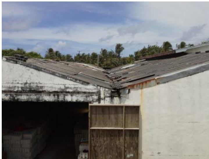
Photo 4: Damaged asbestos roof cladding at the Majuro Japan Construction Co.