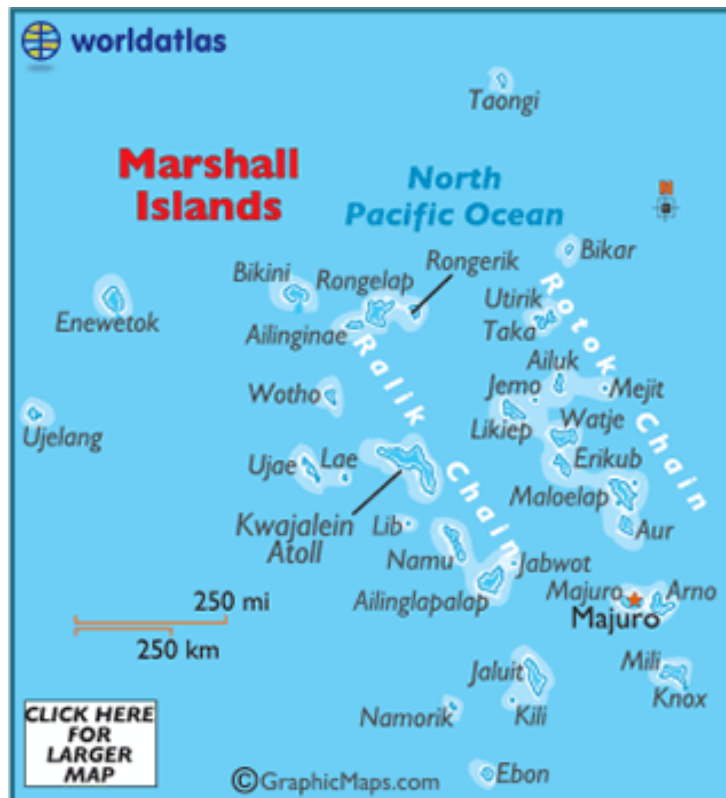
Figure 1 – Map of RMI

Politically, the Marshall Islands is a presidential republic in free association with the United States, with the US providing defense, subsidies, and access to social services. The country uses the United States dollar as its currency. The majority of the citizens of the Marshall Islands are of Marshallese descent, though there are small numbers of immigrants from the Philippines and other Pacific islands. The two official languages are Marshallese and English.