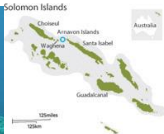
Figure 1 showing a juvenile hawksbill turtle swimming in the ocean. A map showing Solomon Islands and Arnavon islands in blue dot

The Solomon Islands' Arnavons site is remote with little infrastructure. Conducting research there is challenging. Hence, the site has been studied by only a few researchers in the past decade. A total area of 152sq Km and land area of 3 Sq Km consist of small group of islands known as Sikopo, Kerehikapa and Malevona (Small & Big).