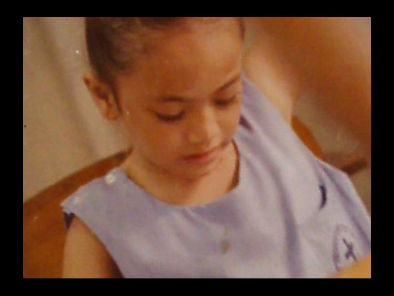
Age ; Seven This point in my life I was quite certain I wanted to be a Lawyer