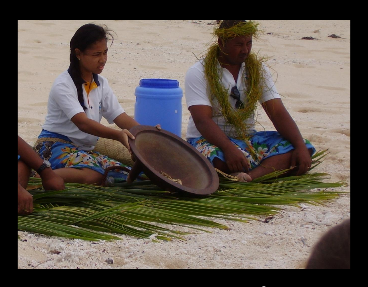
WELCOMING OF THE WHALES ©