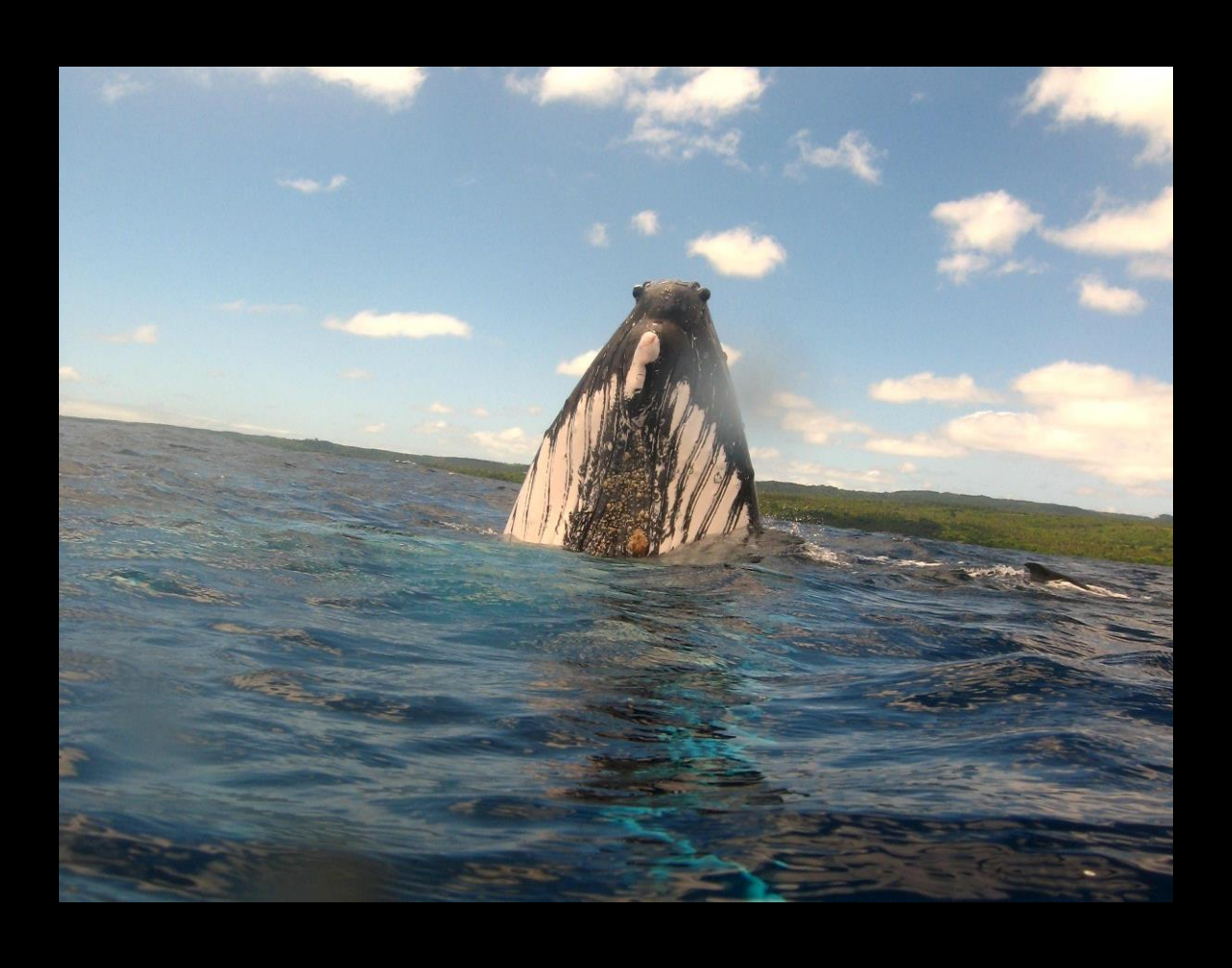
Whales / Marine + Ocean = OCEANHOLIC