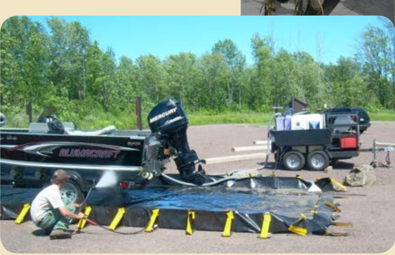
Inspecting and cleaning a boat to remove invasive plants and mollusks.