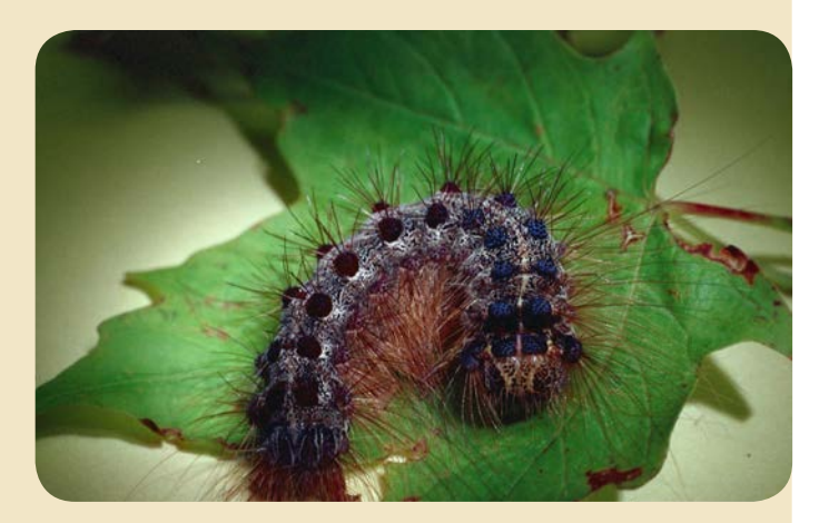
Gypsy Moth Larvae.

A key lesson to learn from the success of the gypsy moth Slow-the-Spread Program is the importance of working with partners to promote and implement a coordinated, regionwide program based upon the biological parameters of the pest. Gypsy moth Slow-the-Spread exemplifies a well-coordinated, broad landscape response that is often necessary to effectively respond to invasive pests.