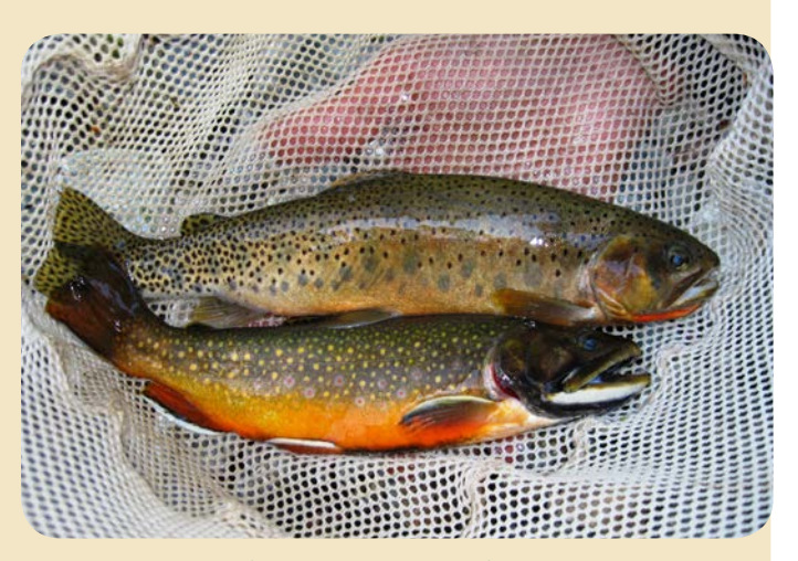
Cutthroat trout (Oncorhynchus clarkii) and brook trout (Salvelinus fontinalis).

Although many restoration efforts focus solely on fish habitat, this effort illustrates the importance of restoring genetically pure fish populations. Forest Service scientists are supporting native trout restoration in Cherry Creek and other areas by assessing the effectiveness of restoration efforts, assessing and monitoring the extent of hybridization across the Interior Mountain West, and identifying areas for restoration that will be most resilient to changing weather patterns.