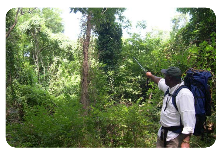
Forest Service employee conducting invasive species survey.

The Forest Service will develop and implement efficient