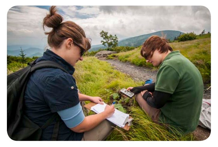
Forest Service employees record survey results.