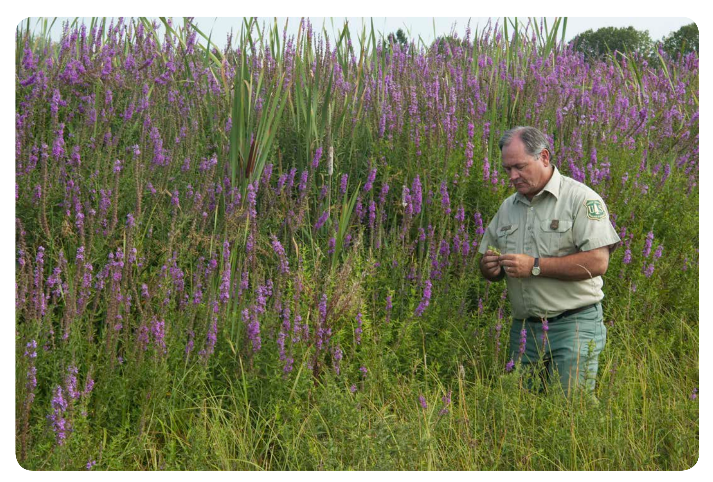
Purple Loosestrife ( Lythrum salicaria L. ) on the Sawtooth National Forest, Idaho.

grammed at the regional scale, as appropriate. The ISSA guiding principles and the roles and responsibilities sections clarify the roles of the national office, Northeastern Area, International Institute of Tropical Forestry, and regions, stations, and forests (appendix A). Successful implementation of the ISSA involves coordination and communication among all parts of the agency and effective outreach and collaboration with local, regional, national, and international partners.