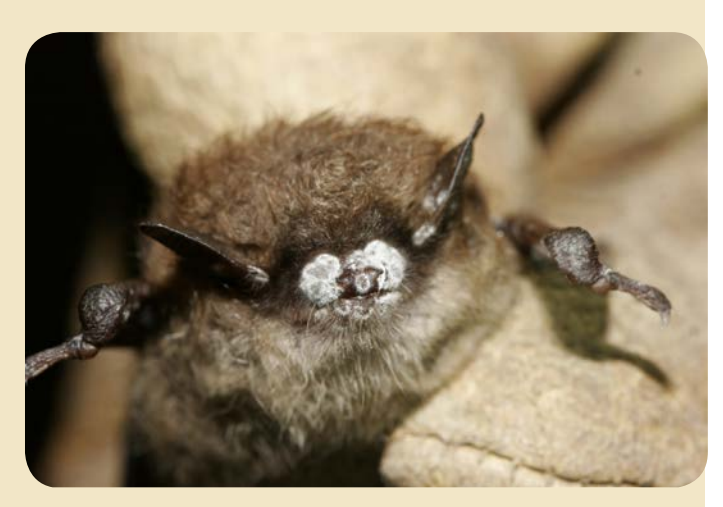
Little brown bat; close-up of nose with fungus, New York, October 2008.

Hibernating bats species are threatened by a rapidly spreading, lethal disease called white-nose syndrome (WNS). The disease is caused by a new fungal pathogen, presumed to be exotic, called Geomyces destructans. It was first discovered in 2007 in upstate New York and has already killed more than a million bats, including rare and endangered species. The pathogen is spreading rapidly south and west. The Forest Service is very concerned about the spread of WNS, an unprecedented wildlife health crisis, and has joined with other agencies and conservation organizations in restricting access to caves and mines to help slow the spread of WNS. Forest Service scientists worked with partners to develop a sensitive test to detect the fungus in cave soils. Now they are evaluating the genetic viability of the Indiana bat based on current population losses, to look for resistance to the disease among hibernating bat species, and to characterize the distribution of the pathogen in cave sediment samples from bat hibernation sites in the Eastern United States. Bat biologists working on WNS are using this research to devise strategies to save these animals from extinction.