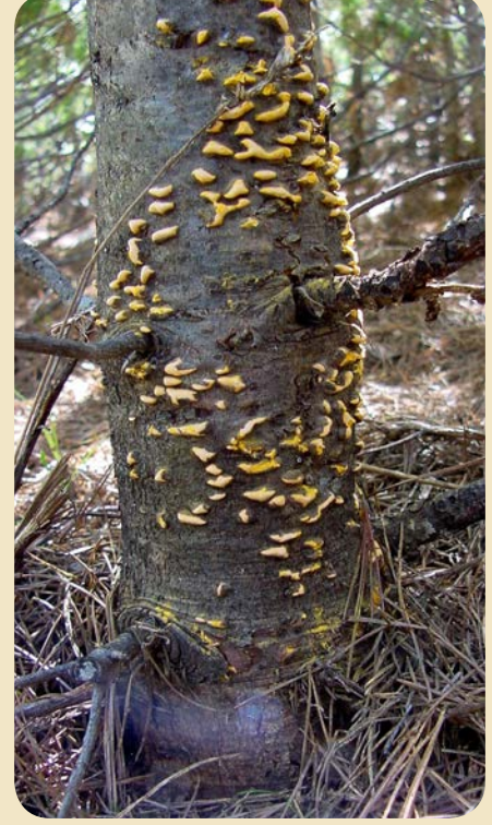
White pine blister rust (Cronartium ribicola).

Proactive management strategies are being tested that encourage regeneration in advance of the pathogens arrival so that a larger pool of genotypes is present (Schoettle and Sniezko 2007). Then natural selection will allow the survivors with more resistance to the rust pathogen to reproduce. In addition, preparation for early deployment of genetic resistance through plantings into threatened ecosystems is underway to sustain ecosystem health and function as blister rust continues to spread. Collaboration across Forest Service deputy areas and with cooperators/partners in other Federal and State agencies and tribes is essential to making progress in protecting, sustaining, and restoring key white pine ecosystems, including high-elevation ecosystems.