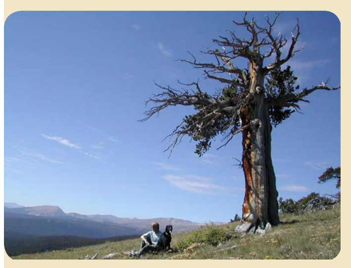
High-elevation western pines are threatened by invasive white pine blister rust, native bark beetles, and weather patterns.

Since the 1950s, resistance screening has identified sources of resistance and genetic diversity in commercial white pine species. Recently, Forest Service scientists addressed questions about resistance in noncommercial, high-elevation species as well. Collaborations across all three deputy areas identified resistant individuals (called "plus trees") for further testing and have identified seed transfer zones to ensure that new plantings are adapted to local conditions. Forest Service scientists are developing and using genetically resistant