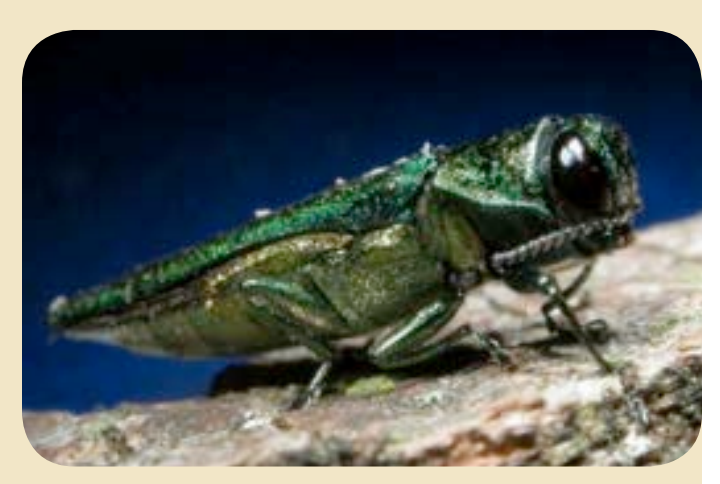
Emerald ash borers and other borers move with firewood.