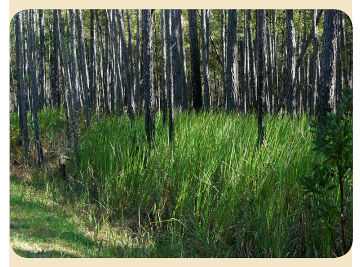
Cogongrass (priority 2 weed) invading pine stand on Francis Marion National Forest.

The Francis Marion and Sumter National Forests in South Carolina work closely with State agencies, the Southeastern Exotic Pest Plant Council, and other stakeholders to develop, prioritize, and coordinate invasive plant management activities on the forests and adjacent lands. The teams developed a joint list of the 50 high-risk invasive plants and prioritized prevention and control efforts based on threat distribution, threat to forest resources, and the geographic area threatened. The Forest Service eradicates high-risk species not known to occur on Forest Service lands and detects and manages invasive species that threaten priority habitats.