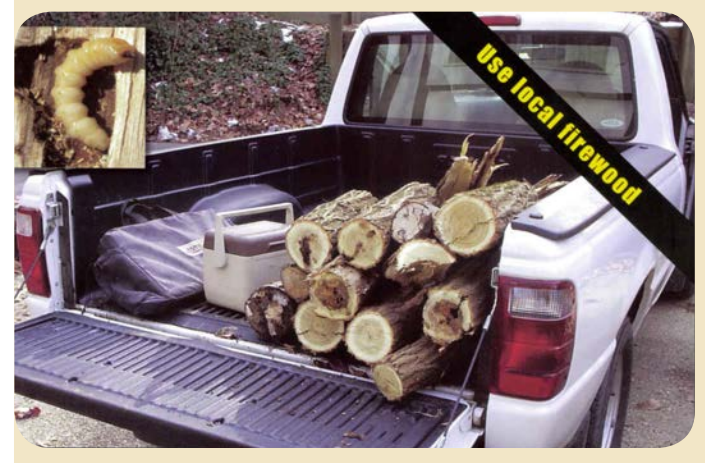
Don't move firewood, use local firewood—on Northeastern Area's don't move firewood poster (NA-PR-02-06).

Nationally, the Forest Service continues to collaborate with the U.S. Department of Agriculture, Animal and Plant Health Inspection Service; the National Association of State Foresters; the National Plant Board; and others to develop and implement national standards for "pestfree" firewood. In addition, Forest Service scientists at the National Threat Centers and their partners focused on pathways for human-assisted spread of forest pest species. This research helps to craft strategies that help land managers prepare for and respond to the spread of multiple pests across very large regions in North America.