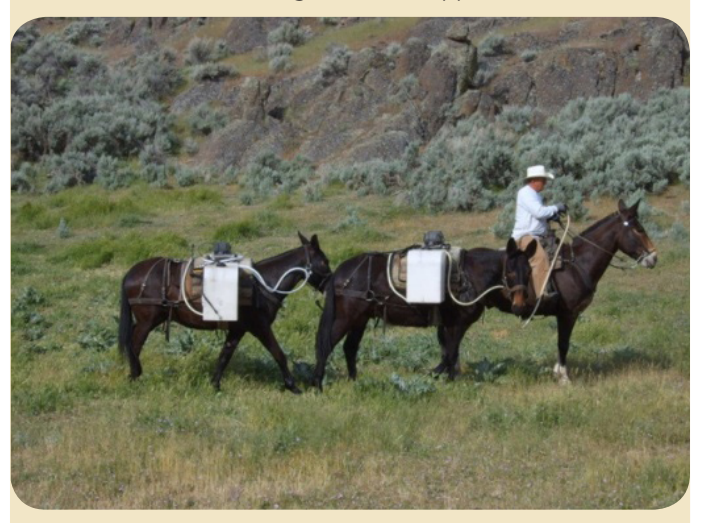
Horse-mounted pesticide application equipment used for backcountry weed eradication on national forests.

The Jackson and Buffalo Ranger Districts of the Bridger-Teton National Forest make up 52 percent of the land within the Jackson Hole Weed Management Association. In the past, weed invasions tended to enter the forest near the boundaries of lands of other jurisdictions and at the periphery of the Jackson Valley, typically along roads, trails, and river corridors, and spread into the forest from there. In 2006, using this geographic information and a list of 15 priority "new invader" plant species, the Forest Service initiated an Early Detection and Rapid Response (EDRR) program in priority (emphasis) areas, with the objective of eradicating those high-risk invasive plants before they could get a foothold and spread. By adapting the geospatial and tabular capability of the Natural Resource Information System-Terra invasive species application, the Forest Service identified almost 7,000 priority acres for detection and immediate eradication efforts. In total, the Forest Service successfully eradicated 15 priority species from those 7,000 acres. One emphasis area was the Teton Wilderness. The forest hired a packhorse contractor with extensive experience to detect, map, and treat all listed species of priority invasive weeds within the Teton Wilderness. This jointly funded Forest Service and Rocky Mountain Elk Foundation effort was the first broad effort to proactively confront and successfully address the invasive-weed problem within the Teton Wilderness using the EDRR approach.