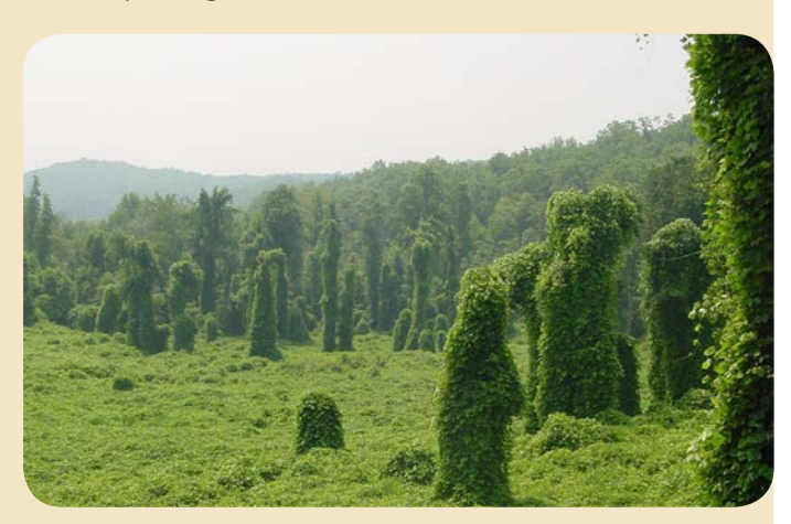
Eastern Threat Center scientists are populating a comprehensive database, useful when developing early warning systems, risk assessments, and management plans for invasive plant species such as kudzu ( Pueraria lobata ).

Scientists also are developing a tool to prioritize treatment of invasive plants in the Intermountain West by identifying key environment and species attributes to focus on, community and ecosystem tipping points, and the most effective treatments. Eventually this tool will be scaled up and generalized to the Western United States.