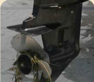
Propeller clogged with an invasive weed.

from one waterway to another. This partnership also developed a seven-episode conservation education television program about aquatic invasive species issues in the Great Lakes region. These outreach and education efforts have already reached tens of millions of people. Also part of this invasive species prevention campaign, the Forest Service, in association with local partners, has deployed portable high-pressure, high-temperature washstations at key water access sites. The employees at these washstations teach boaters about aquatic invasive species, answer questions, share printed materials, and inspect and clean boats and trailers.