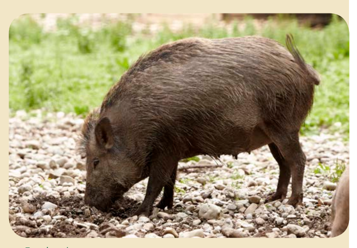
Feral swine.

Feral pigs (Sus scrofa) are formerly domestic swine hybrids that are free-roaming. Their rooting in the ground for food creates large areas of disturbance, which causes soil erosion, degrades water guality in streams, and damages property. More importantly, ground disturbance promotes the introduction and establishment of many invasive plants. In addition, feral pigs are very effective at dispersing the seeds of the many invasive plants with edible fruits, further exacerbating the spread and abundance of invasive plants. In Hawaii, invasive plants are replacing native species in native forests across whole watersheds and landscapes. In most instances, invasive plant management and restoration cannot be successful until the feral pigs are removed and excluded from the area. The Forest Service is partnering with the State of Hawaii and other organizations to fence large areas (2,000 to 5,000 acres) to enable the removal of feral pigs as a first step toward the restoration of native plant species and communities and the myriad of ecosystem services they provide.