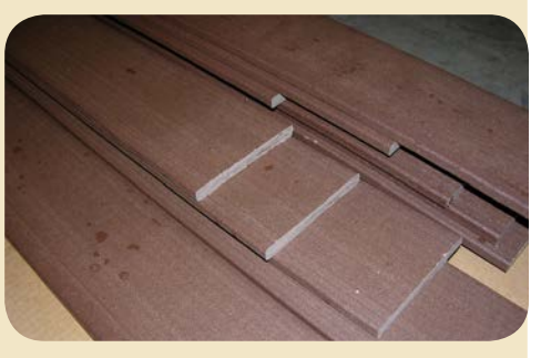
Saltcedar composite boards.

Salt Cedar (Tamarix spp.) on Snake River.