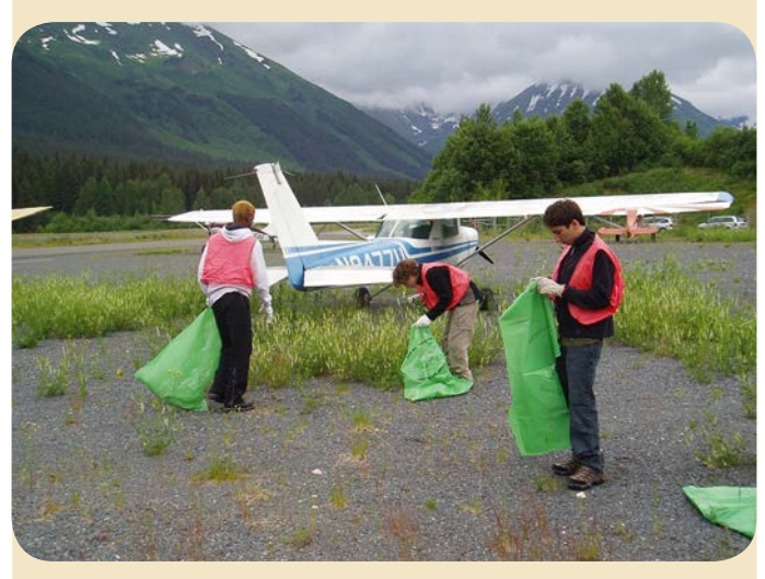
Eradication of white sweetclover ( M. albus ) in Alaska.

White sweetclover (Melilotus albus) and other invasive plants on the Chugach National Forest in Alaska occur in areas of human disturbance and adjacent river systems, but they are generally absent in backcountry areas. In 2006, a large patch of clover was found at the Girdwood Airport, an entryway to a salmon stream. The Forest Service immediately partnered with the town on a weed-pulling campaign by local students. During the first couple of years, a 10-person crew annually pulled weeds and filled dozens of bags during a 1-week-long period. After 5 years, a 2-person crew was able to complete the job in 1 day. This white sweetclover infestation is a priority because the sweetclover has the potential to disburse its seed via the adjacent creek and via aircraft into much larger areas of roadless land throughout the Chugach National Forest and interior Alaska.