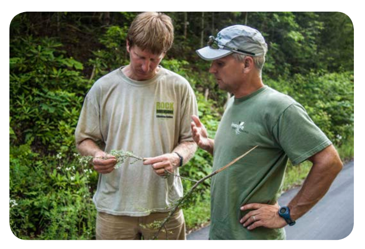
Forest Service employees discuss invasive species management.

CM1—Coordinate as needed with partners. Coordination and collaboration with key partners and other stakeholders will help to identify common objectives