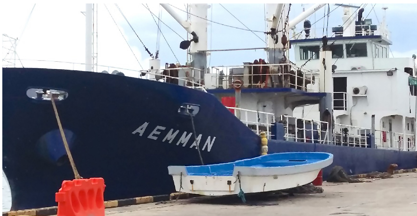
The MV Aemman moored in Majuro

For the small craft, the current practice of using gasoline fuelled outboard engines results in high expenditures and large greenhouse gases emissions for the relatively small size of tasks undertaken. There is a wide range of alternative low carbon solutions that can be deployed and current thinking is toward combining new technologies and traditional solutions, bringing together safety, efficiency and low maintenance advantages. Considering that up to 500 gasoline powered maritime craft may need to be modified or replaced, mass production of new craft should also be considered. Capital cost might appear a barrier, but this will be partially offset by long-term fuel savings. Some of the small craft improvement options may include clever integration of photovoltaic cells and electric outboards, small Flettners, hydrofoils, bio fuel outboards as well as traditional sail systems.