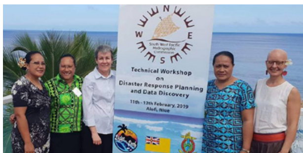
Technical Workshop on Disaster Response Planning and Data Recovery in Niue.

PacWIMA was the first of several regional maritime associations to be established. With the support of SPC and IMO it was first launched in 2005, but had to be relaunched in April 2016 due to lack of commitment and resources. Since then, it has been active and demonstrates the region's willingness to form partnerships and collaborate in order to increase the participation of Pacific women in maritime.