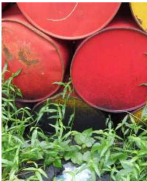
Fig 5: drums sinking into landfill

The claim that the oil in drums came frequently from ships was borne out by the predominance of Shell Oil Company branded drums with Korean language labelling being prominent amongst the new drums that could easily be inspected. Even these newer piles were frequently observed to be dangerous, with piles leaning precipitately, and drums sinking into the landfill (figs 5 & 6).