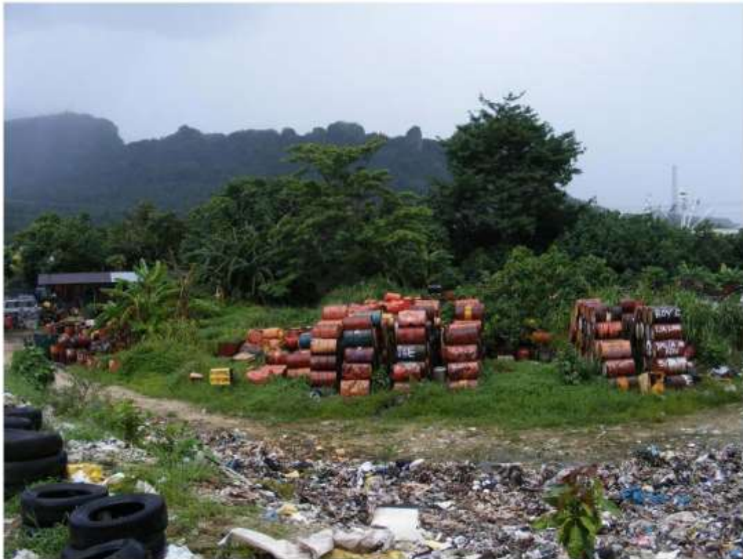
Fig 3: Landfill stockpile in 2014; note position of radio tower on left.