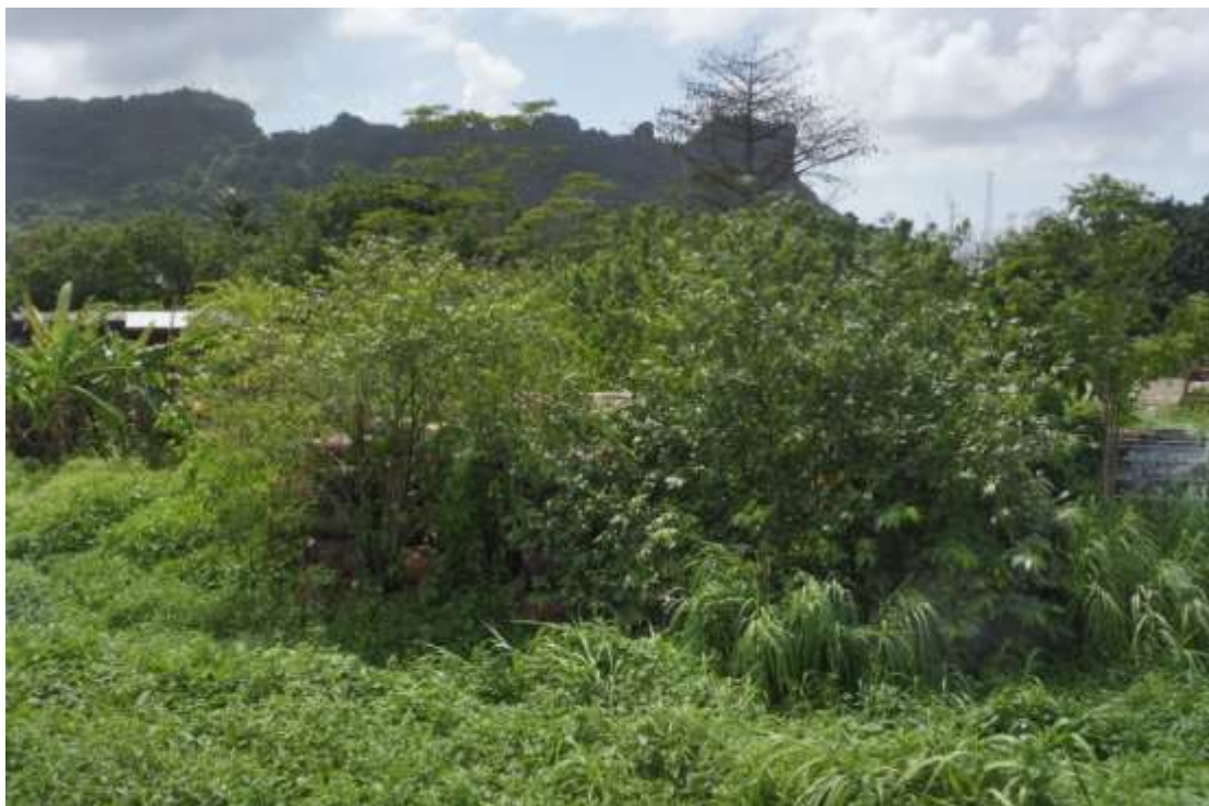
Fig 4: Photo of same site today; note background features of Sokehs Is. skyline