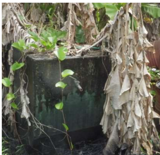
Figure 9: Existing tank at landfill