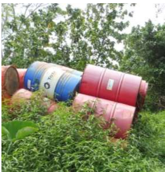
Fig 6: unstable piles of drums

PWMS operates a crude used oil separation process to drain off water and solids. This attempts to ensure that the oil in the drums is reasonably free of water, rags, sludge etc. A simple tank is used with a drain half way up, and the oil that comes in from local sources is usually put through this system and decanted into drums. The water and solids are drained off and dried. The sludge is dried and landfilled in the same manner as oil spill clean up mops. This would be considered acceptable practise under the Basel Technical Guideline for Used Oil 1 (section 34, p. 7)