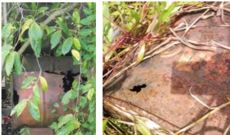
Figures 1 & 2: drums completely rusted out in landfill stockpile

The landfill has been keeping records since January 2016 on the incoming used oil. Records for every month since then are incomplete, but for the 13 months that do have figures, 47,000 litres are recorded as incoming (quantities are recorded in gallons). Extrapolating those figures for the 43 months since the 2014 audit gives figures of around 150,000 extra litres, or about 720 extra drums. That would bring the estimated total on site to around 1,900 drums, or around 400,000 litres. Monthly incomings are of the order of 3,600 litres; at that level, annual incomings would be around 43,000 litres, or just over 200 drums. The drums could not be counted accurately as many are covered in creepers and some piles are very unstable and it would be dangerous to walk around and over drums to get a better estimate. Some drums have sunk into the landfill as it is soft. Much leakage is evident; some drums were observed to have rusted out into large holes (figures 1 & 2). Given the inaccessible nature of the stockpile, and the danger in moving around it, a significant number of drums can be expected to have leaked out over the last ten years.