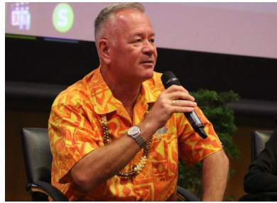
LOW CARBON DEVELOPMENT IN THE PACIFIC - "IT MAKES SENSE."