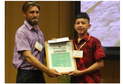
"PACIFIC TAKE A STAND" COMPETITION WINNERS ACKNOWLEDGED AT PRM