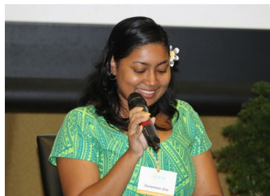
CALL FOR MORE YOUTH INVOLVEMENT IN LOW CARBON DEVELOPMENT AND CLIMATE CHANGE AT NATIONAL, REGIONAL AND GLOBAL LEVELS