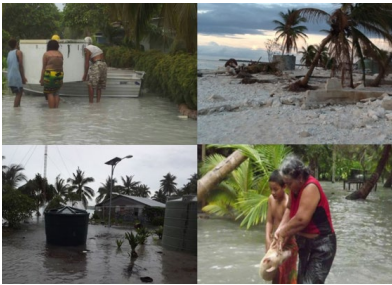
EARLY WARNING SYSTEMS HELPING TO BUILD RESILIENCE IN TUVALU