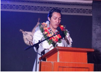
INAUGURAL PACIFIC RESILIENCE MEETING KICKS OFF IN SUVA