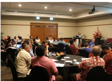
FUTURE OF INFORMATION AND KNOWLEDGE MANAGEMENT IN THE PACIFIC DISCUSSED AT THE PACIFIC RESILIENCE WEEK