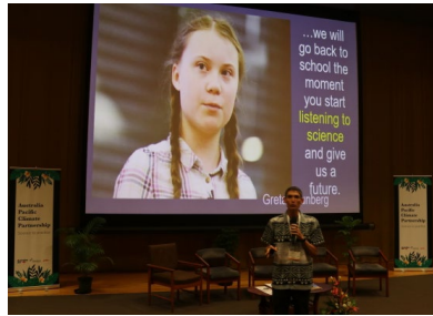
AUSTRALIA PACIFIC CLIMATE PARTNERSHIP EMPOWERING YOUTH IN CLIMATE CHANGE