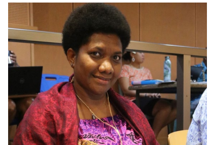
VANUATU MULTI-HAZARD EARLY WARNING, SEISMIC AND VOLCANIC SYSTEMS HIGHLIGHTED AT THE PACIFIC RESILIENCE MEETING