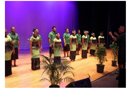
BUILDING PACIFIC RESILIENCE - WE ARE STRONGER TOGETHER